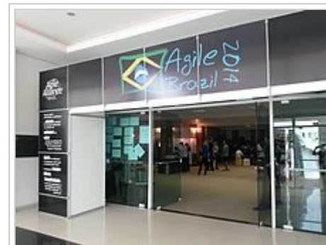
Agile Brazil 2014 conference

Under an agile business management model, agile software development techniques, practices, principles and values are expressed across five domains. [111]